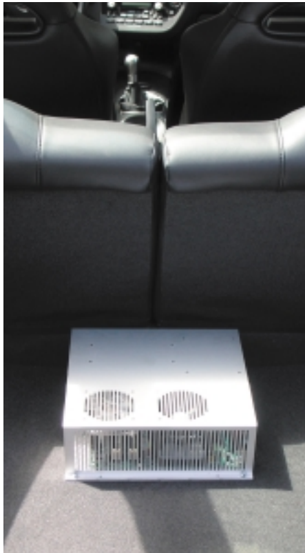
The aluminum CarCPU system unit looks very high tech and we chose to show it off rather than hide it.

As most road warriors know, mobile systems rarely offer the speed and power of a good desktop. That's because a mobile must be small and light and run off its internal battery. The CarCPU, on the other hand, uses the vehicle's electricity, so power consumption is less of an issue and there are no performance compromises. I shouldn't say none as the company had to decide just