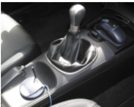
Gyration's wireless optical mouse doesn't need a surface. You can use it in the air.

So what exactly do you get when you order CarCPU's US$2,879 "Elite" system? First an elegant 11 x 11 x 4 inch system enclosure made entirely of sturdy anodized aluminum with a tech-looking brushed finish. It uses an Intel D865CLC motherboard with a 2.6GHz Intel Pentium 4 CPU,