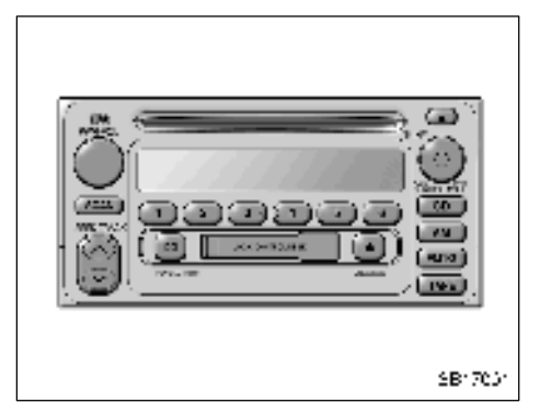
AM-FM ETR radio/cassette player/compact disc player (with compact disc auto changer controller)