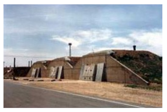
Bunkers at Pantex used for temporary staging of nuclear weapons.

Another problem is that we are told 3,600 people work there. Problem with that is I only see about 150 cars in three small lots. Then we get this picture: