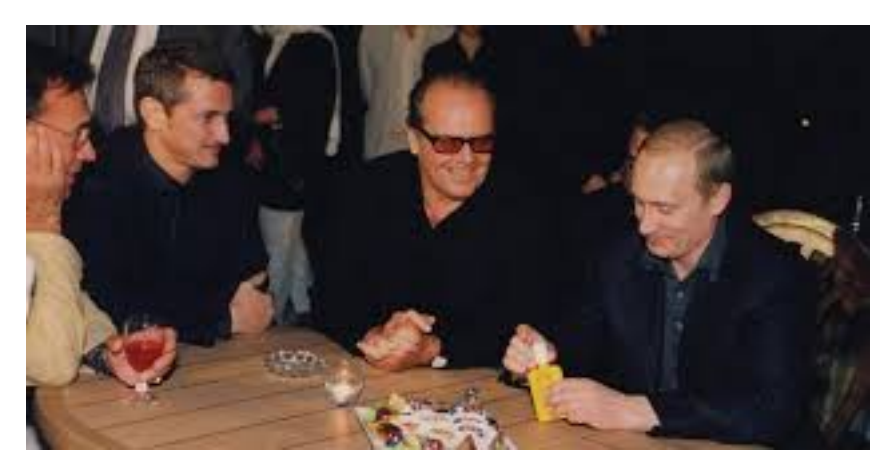
Well, he isn't the only one hanging out with Putin: