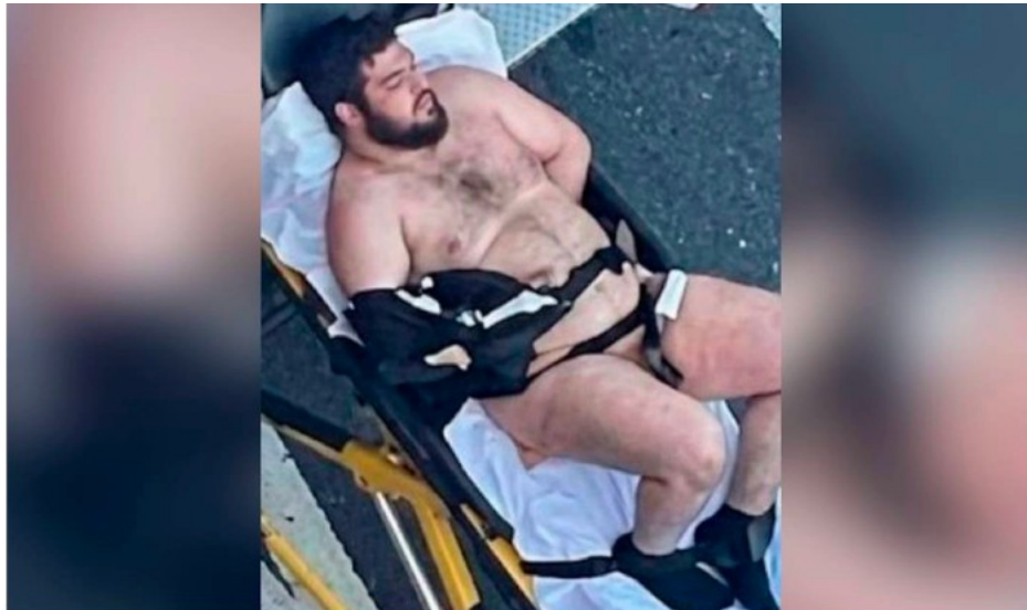
The suspect in the White House shooting.

I just noticed the photographer there: Brian Fantana. Isn't that Paul Rudd's character from Anchorman ? And let's see, wasn't he a cameramen, photographer? Yep.