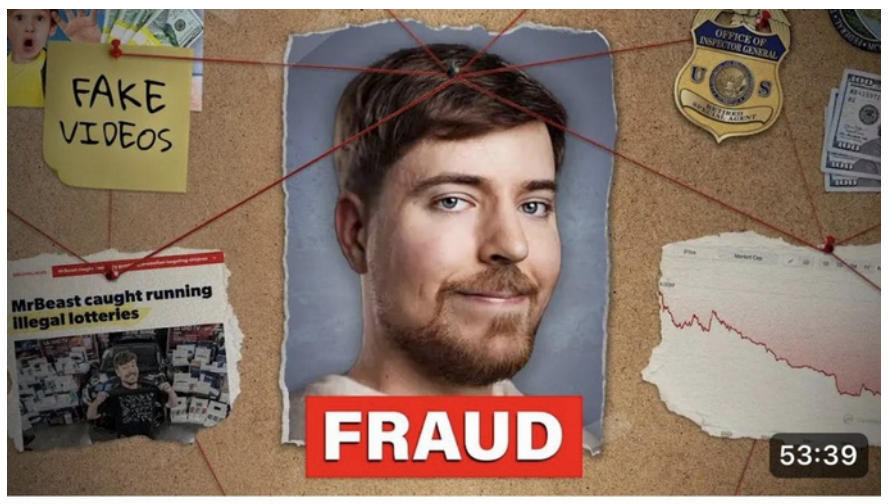
I Worked For MrBeast, He's A Fraud DogPack404 · 3M views · 4 days ago