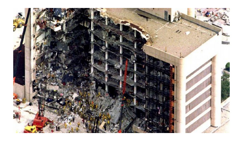
The whole front of the building is carved out, isn't it? So are we told why that didn't happen in Oslo? Nope. This is also interesting: