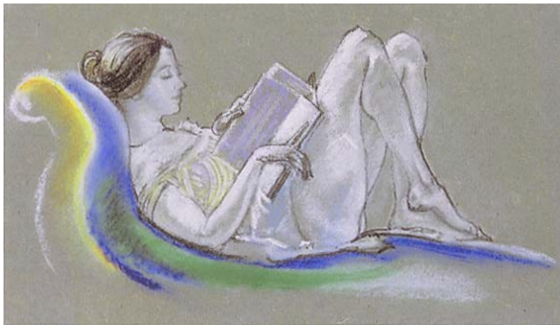
One of Davies' awful exhibits at the Armory

History has been rewritten to make us think the artists Arthur B. Davies and Walt Kuhn organized the Armory Show, but they were just hired as fronts. Kuhn worked for John Quinn and Wikipedia even admits that. We are told he was his “art advisor.” We are also told that Kuhn “acted as the executive secretary and was delegated as one of the men to find European artists to participate.” Delegated? Delegated by whom? If he were really one of the founders of the Association of American Painters and Sculptors (AAPS), and they were really running the Armory Show, he wouldn't be “delegated” anything. Curious wording. We can now see he was delegated this task by Quinn.