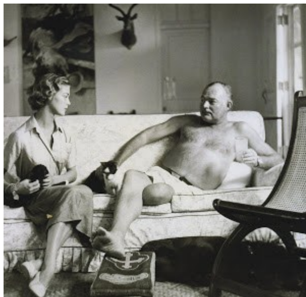
weird photo of a bloated man leering at his uncomfortable daughter, who is trying to remove the kittens before he eats them

This time I was sent to research Hemingway, though again, I can't really say why. My recent papers proving that the CIA has been involved in the promotion of Modernism have given me suspicions about absolutely everyone famous in the arts, but logic would tell me that many are far more suspicious than Hemingway. I have never even thought of Hemingway as a Modern, though my research now informs me I was wrong about that. All I knew before today is what is left of my old readings and conversations. We were assigned A Farewell to Arms in my junior year in high school, and I disliked it for many reasons. These reasons match up very well with the reasons John Irving gave in The New York Times in the summer of 2012: he hated the short sentences, the sparse journalistic style, and the macho posing. In addition, I also hated the cardboard characters, the emotionless and humorless