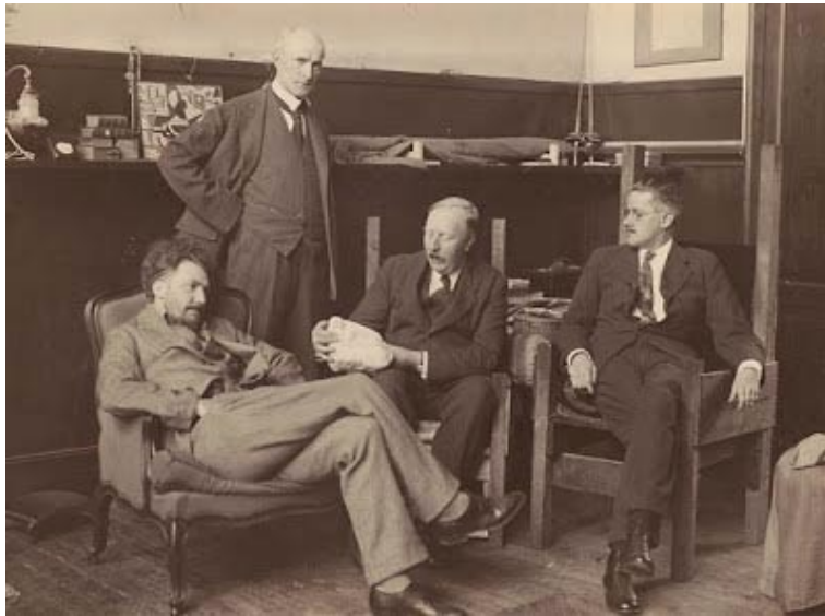
Ezra Pound, John Quinn, Ford Madox Ford, James Joyce

Again, we can't understand without knowing who is behind Pound. The picture above tells us, literally, since the man standing behind Pound is our clue. Yes, we finally have clear evidence in 1924, when Pound secures funding for Ford Madox Ford's Transatlantic Review —which contained works from Pound, Joyce, Stein, and Hemingway. We are told the money came from John Quinn. Who is John Quinn? According to Wikipedia,