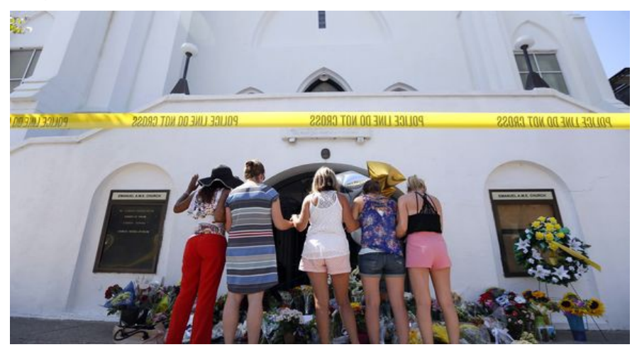
why are four of five of these ladies white?