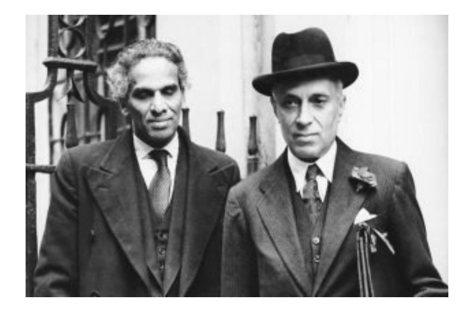
Menon and Nehru - The Goodfellas

Nehru was intimately tied to the Fabian Society (the <u>wolf-in-sheep's-clothing</u> people) and also studied <u>law at the Inner Temple</u>, just like Gandhi. Or did he? This wonderful genuine bona-fide photo should tell you what to think of that: