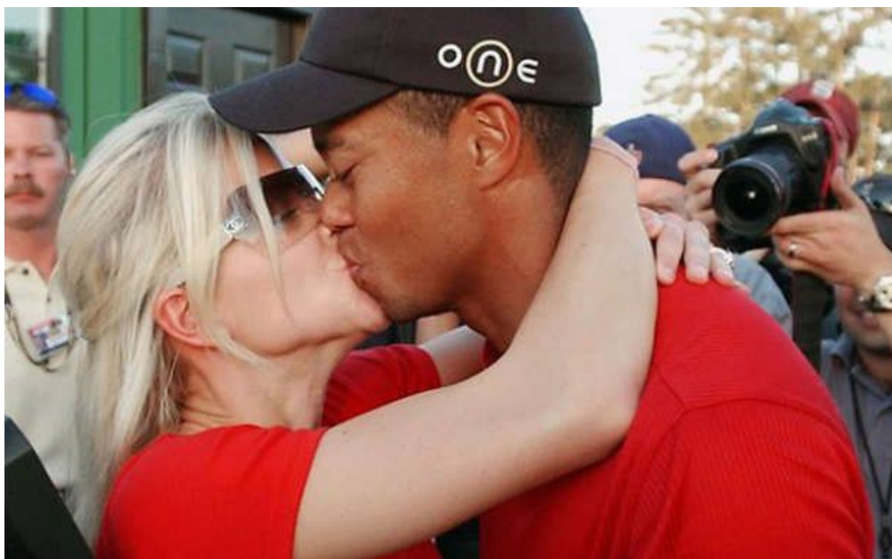
A Hollywood kiss