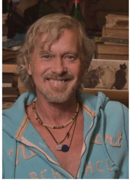
me at age 57, click to see more